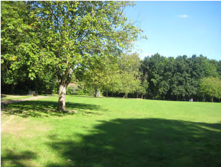
60-68 Waxwell Lane