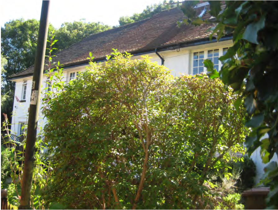
Little Common Open Space